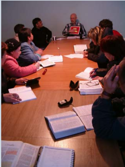
With the help of a translator, I was able to teach local church leaders on two evenings while visiting Central Asia.